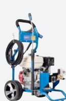
MC 5M - 240/940 PE 280/1000 PE