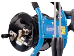
Hose Reel – MC PE Easy pressure-hose storage and protection. For 15 m DN8 hose or 20 m DN6 hose. Includes 0.7m connection hose.