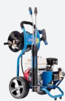
MC 4C - 210/770 PEXT