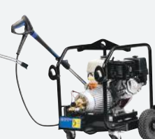
MC 7P - 220/1120 PE PLUS