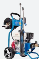
MC 5C - 280/1000 PEXT