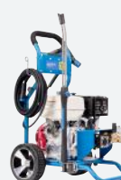
MC 5M - 250/1000 PE