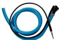
Water-suction kit Ideal for emptying flooded basements, tanks, or pools at up to 300L/min. Can extract up to 20mm of sludge, dirt, sand, stones, algae, etc.