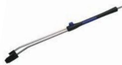
PowerSpeed Plus lance Rotary jet nozzle increases cleaning performance over larger surfaces. Offers multiple effects and benefits. Various nozzle sizes.