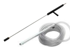
Sandblaster kit Rubber nozzle. Ideal for quick stripping of paint or rust.