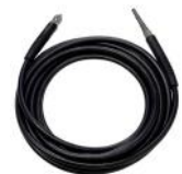
Drain-cleaning kit Hose length: 20m DN10. Designed for unblocking drains, toilets, and pipes.