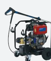
MC 5M - 195/1000 DE